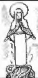
Roman Catholic Mary